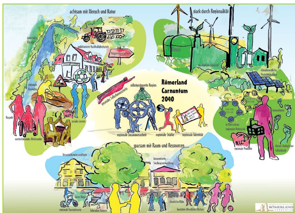
The Vision 2040 of the Austrian region Römerland Carnuntum: Römerland Carnuntum – together. regional. innovative.

These common messages provide some clear pointers as to positive initiatives and policies that would empower rural communities to move towards their desired future as thriving, sustainable, attractive places to live and work. It is striking, however, that most of these messages are not new, and that much of what has been identified by participants in this exercise as important to fill gaps and to achieve opportunities has been known and reiterated for much of the last 30 years at least. Whilst technology and our scientific understanding of the climate and biodiversity crises and their anthropogenic causes have evolved, the value of integrated place-based strategies, calls for capacity building, networking, local empowerment and participation in decision making, adequate service provision, better skills and environmental protection and enhancement have been a constant theme in rural debates and policy papers, from “The Future of Rural Society”, the incarnation and mainstreaming of LEADER, the first and second Cork Declarations (9) and in many other fora. Can the long-term vision for rural areas bring them to fruition so that the vision so beautifully illustrated by “The vision for Romerland Carnuntum in 2040” becomes reality?